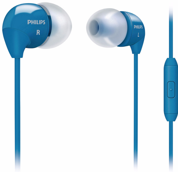
Philips In-Ear Headset