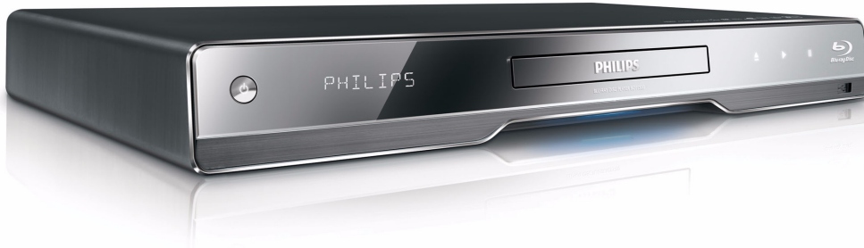
Philips Blu-ray Disc player