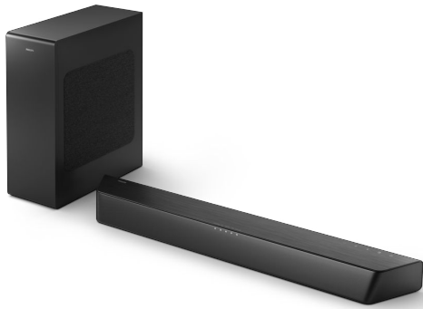
Soundbar 2.1 with wireless subwoofer