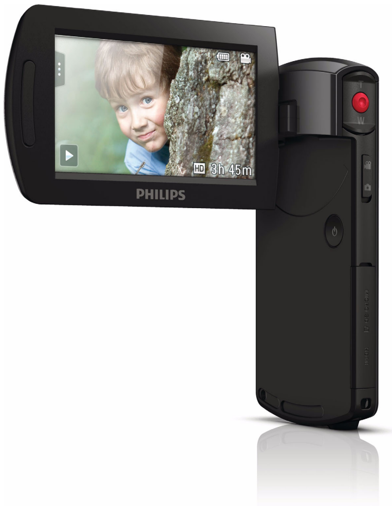
Philips HD camcorder