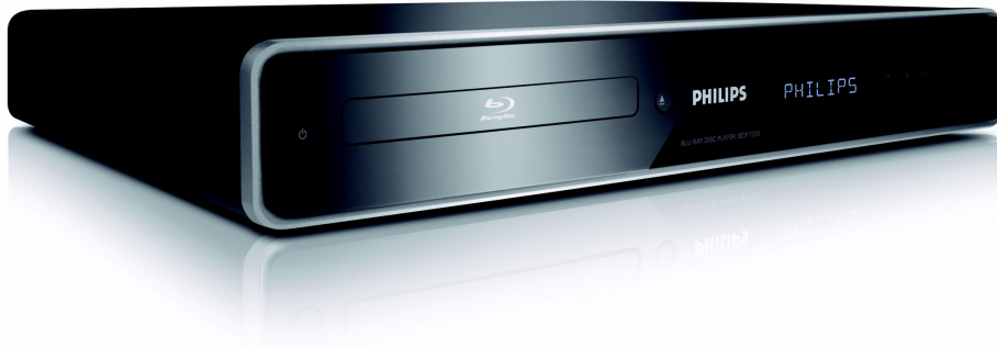
Philips Blu-ray Disc player