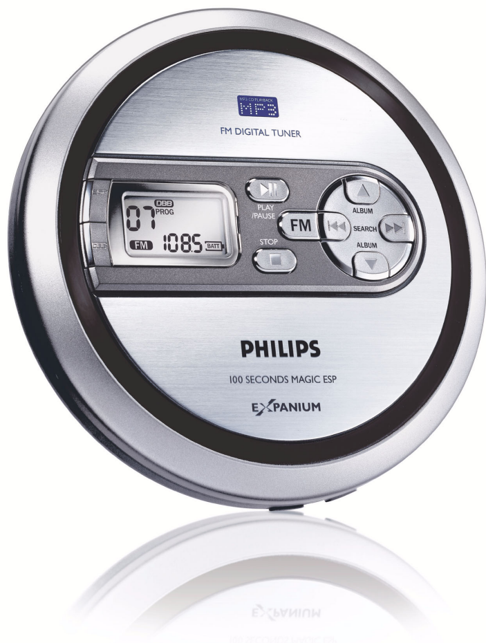
Philips Portable MP3-CD Player