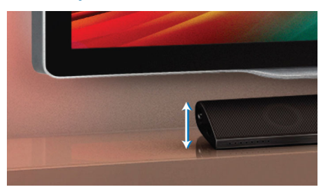
Low-rise profile for the perfect fit in front of your TV