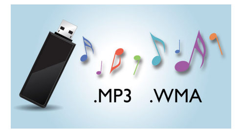
Enjoy MP3/WMA music directly from your portable USB devices