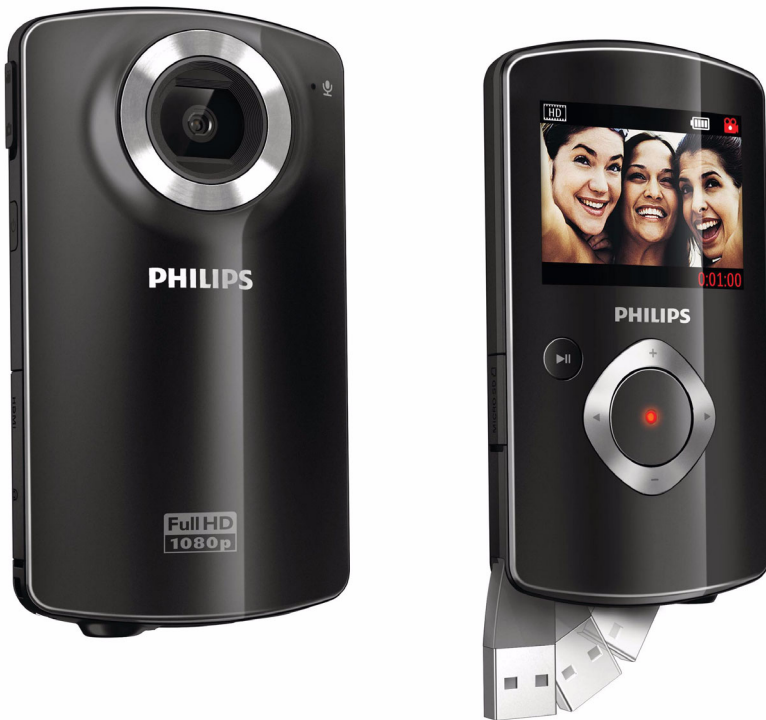
Philips HD camcorder