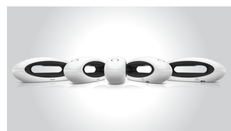
Elegant and stylish appearance from every angle