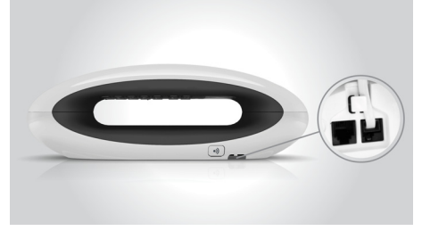
The smart cable management system cleverly hides the wires from sight. Intelligently designed concealed sockets and an internal

cable guide ensure everything is clutter free and neatly tucked away.