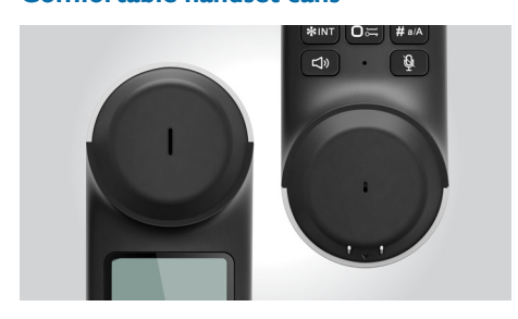
Comfortable handset cans designed for longer calls