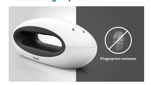
Durable, glossy and fingerprint-resistant outer shell