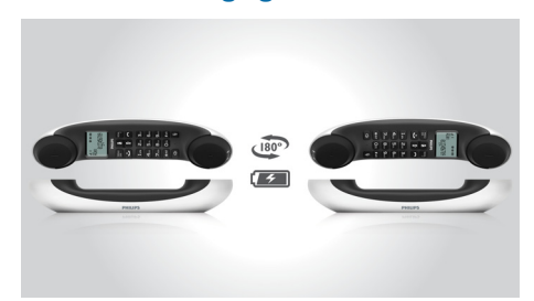
Charge handset either way around