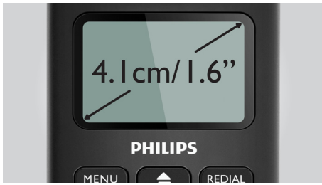
Easy to read, 4.1cm (1.6") 2-line graphical display