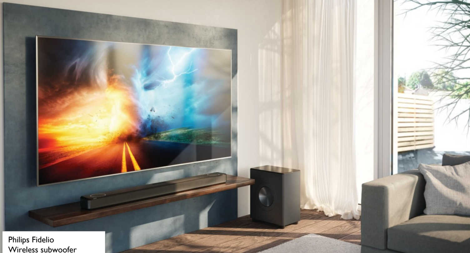
Philips Fidelio Wireless subwoofer