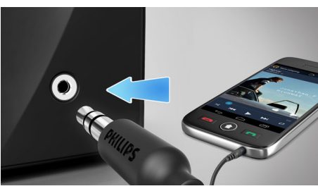
Audio-in for easy connection to almost any electronic device