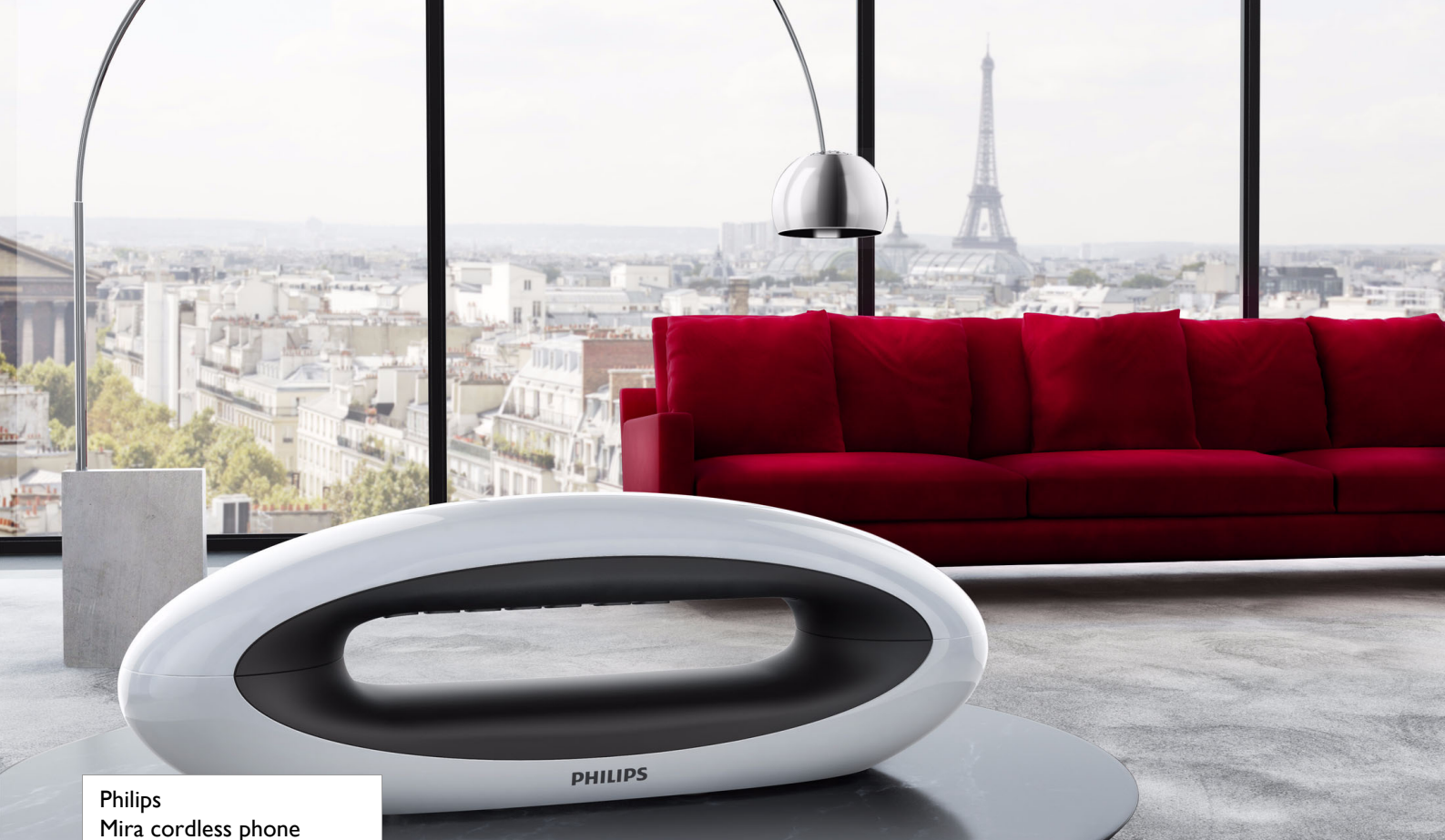
Philips Mira cordless phone