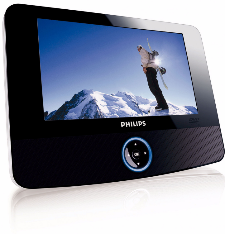
Philips Portable DVD Player

17.8 cm (7") widescreen LCD DivX playback