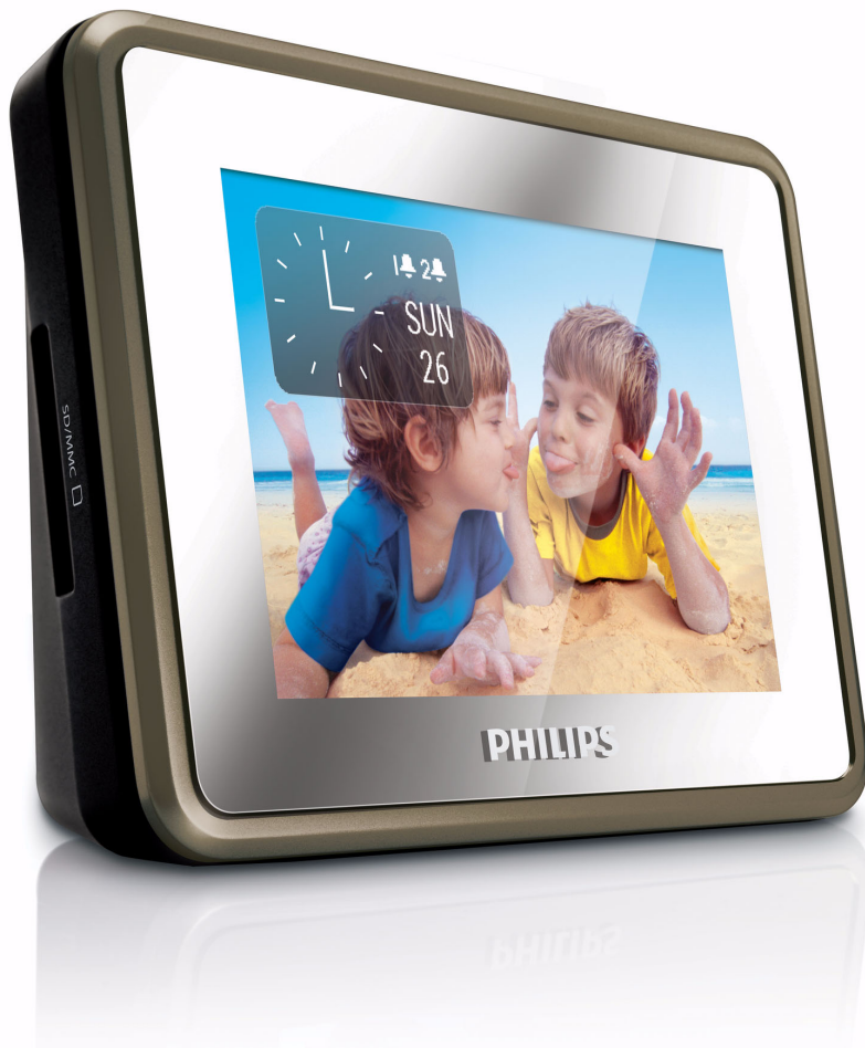
Philips Clock Radio