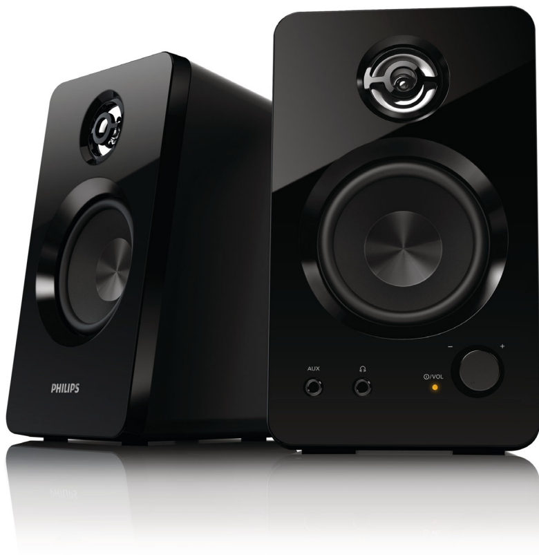
Philips Multimedia Speakers 2.1