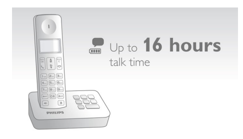
Up to 16 hours of talk time on a single charge