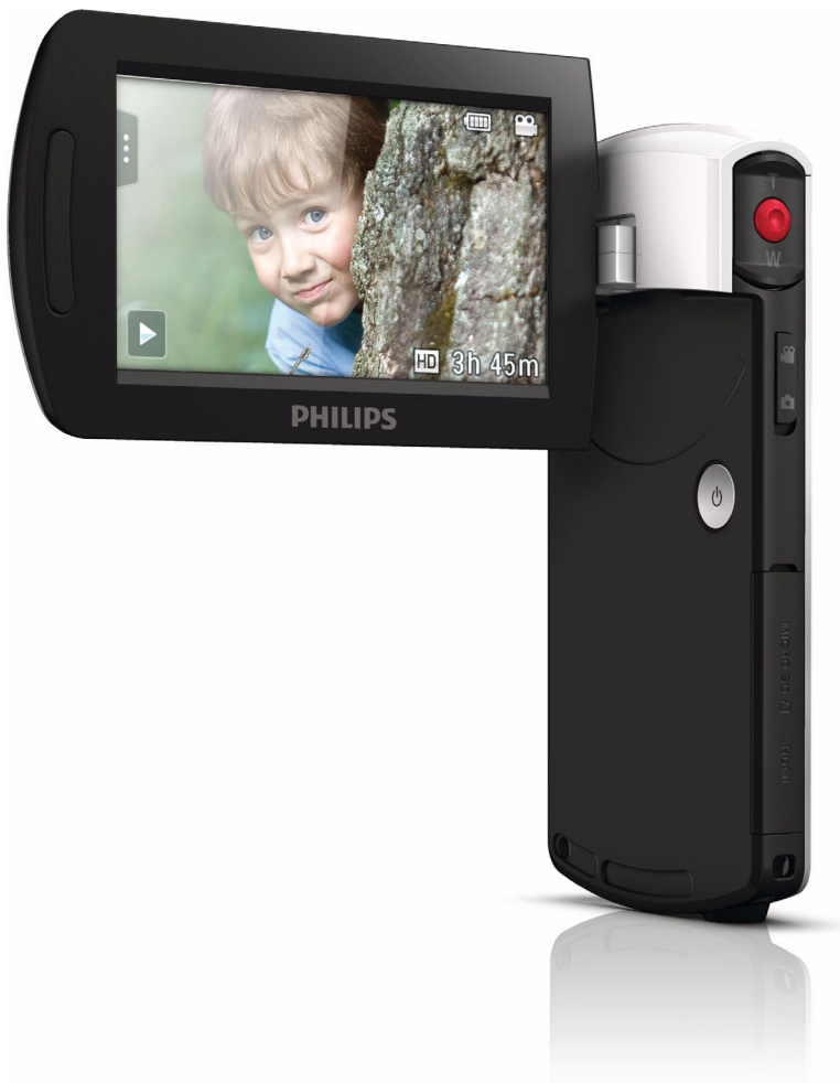
Philips HD camcorder