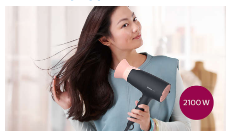
This 2100W hair dryer creates powerful airflow for beautiful results every day.