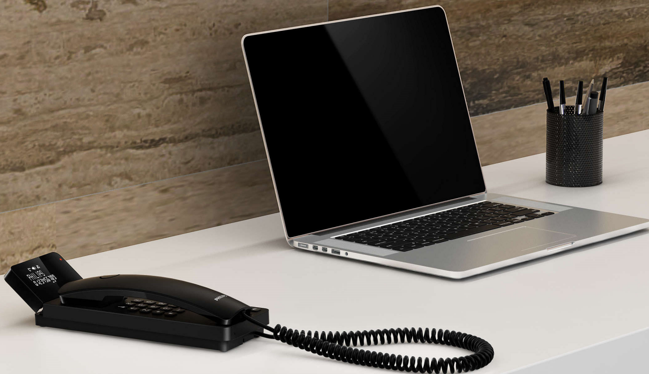
Philips Scala design corded phone

2.75" display/white backlight Speakerphone