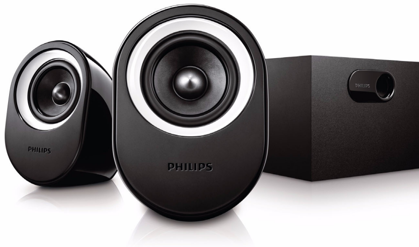
Philips Multimedia Speakers 2.1