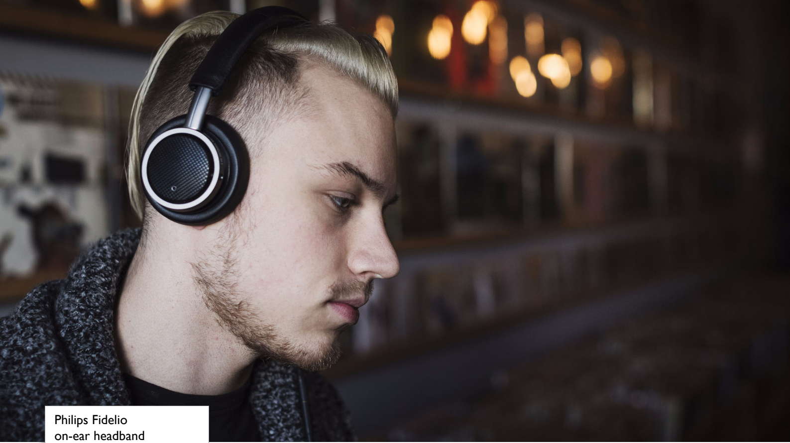
Philips Fidelio on-ear headband headphones