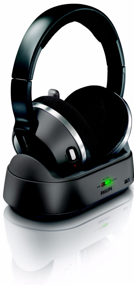
Philips Wireless HiFi Headphone