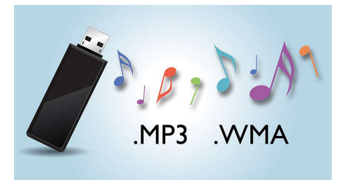
Enjoy MP3/WMA music directly from your portable USB devices