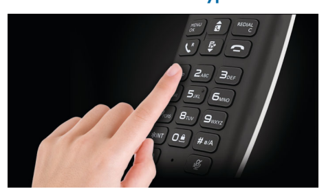
Calibrated keypad for smooth precision clicks