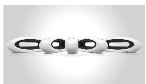
Elegant and stylish appearance from every angle