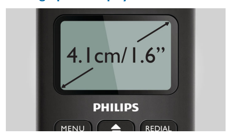
Easy to read, 4.1cm (1.6") 2-line graphical display