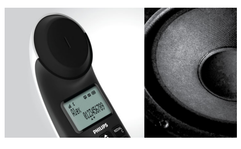
Advanced sound testing and tuning for superb voice quality