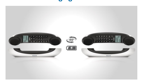
Charge handset either way around