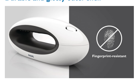
Durable, glossy and fingerprint-resistant outer shell