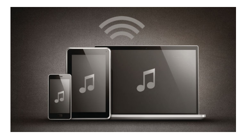
Bluetooth<sup>®</sup> (aptX<sup>®</sup> and AAC) for wireless music steaming