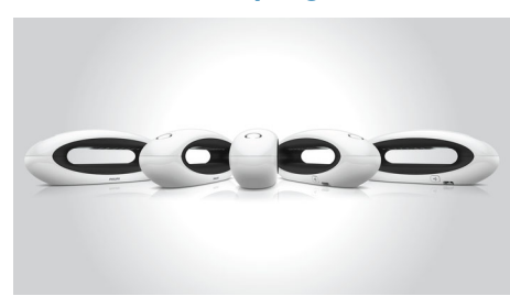
Elegant and stylish appearance from every angle