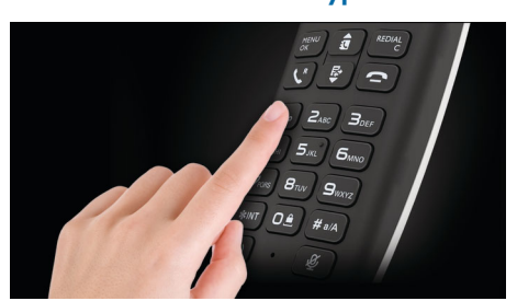
Calibrated keypad for smooth precision clicks