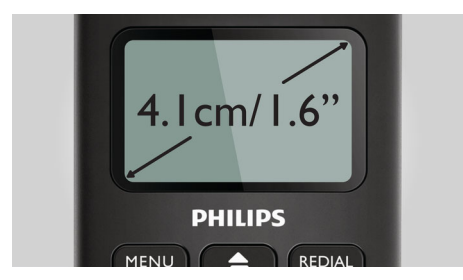
Easy to read, 4.1cm (1.6") 2-line graphical display