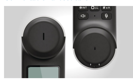
Comfortable handset cans designed for longer calls