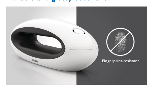
Durable, glossy and fingerprint-resistant outer shell