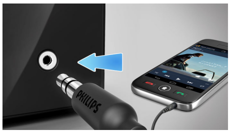
Audio-in for easy connection to almost any electronic device