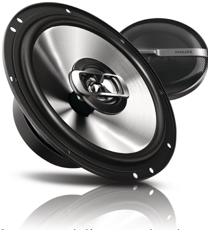
Philips Car coaxial speaker