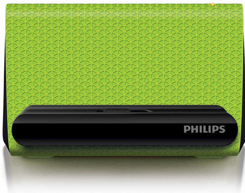
Philips Portable speaker