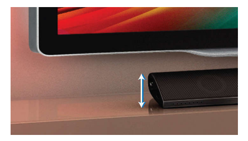
Low-rise profile for the perfect fit in front of your \mathsf{TV}