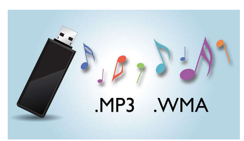
Enjoy MP3/WMA music directly from your portable USB devices