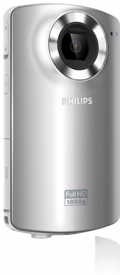
Philips HD camcorder