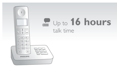
Up to 16 hours of talk time on a single charge