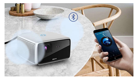
Play your music directly on the projector. Use your Screeneo as a Boombox by connecting your smartphones or any other Bluetooth device to enjoy big sound.