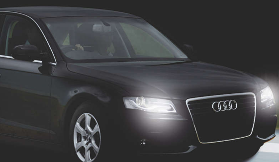
Philips X-tremeVision Headlight bulb