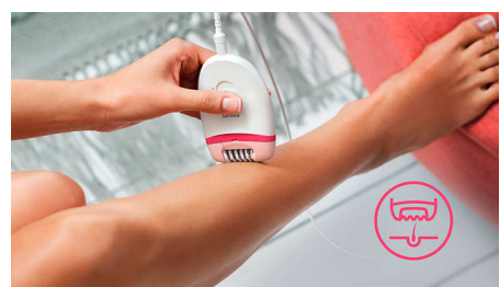
Efficient epilation system leaves your skin smooth and stubble free for weeks