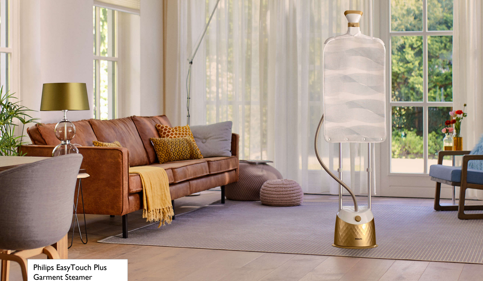
Philips EasyTouch Plus Garment Steamer