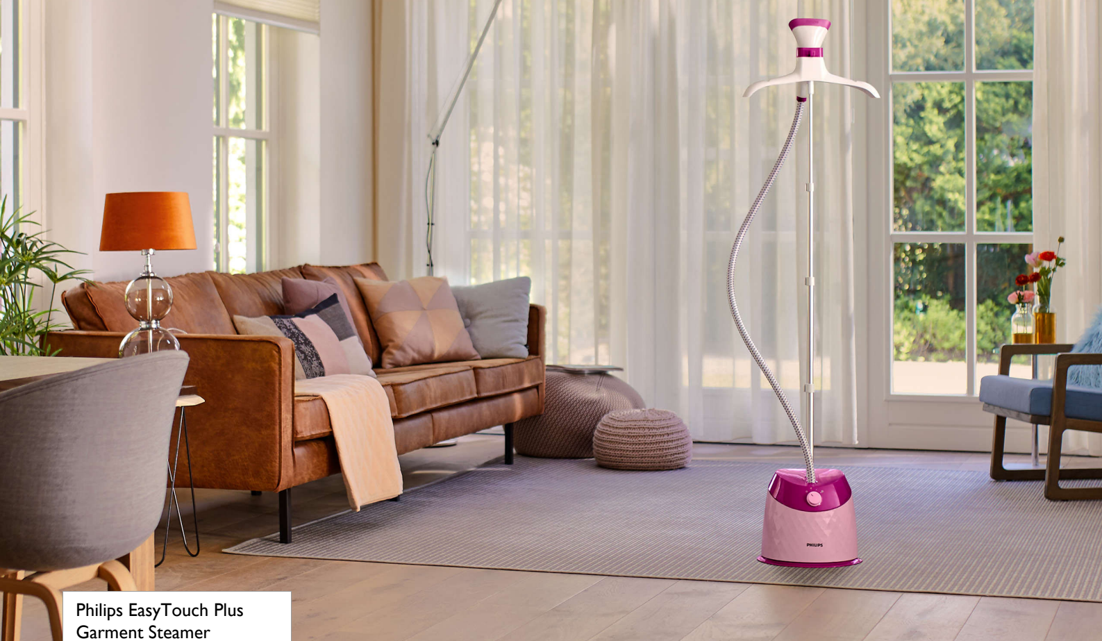
Philips EasyTouch Plus Garment Steamer

1600W, 32g/min 3 steam settings 1.6L Detachable tank