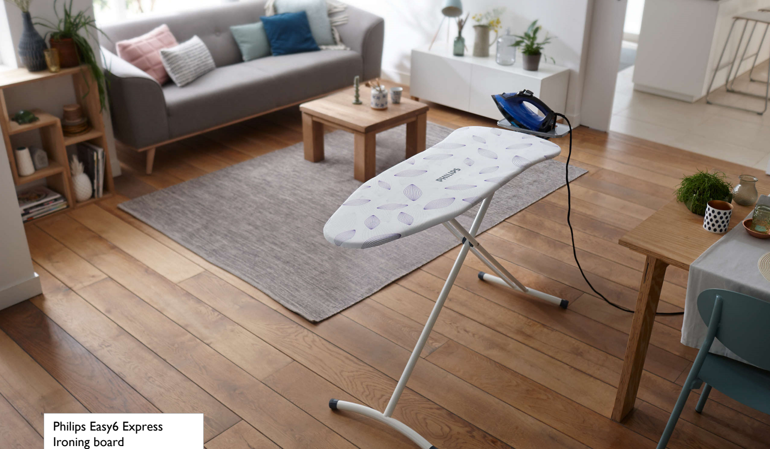
Philips Easy6 Express Ironing board