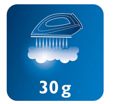
Continuous steam up to 30 g/min for better crease removal.