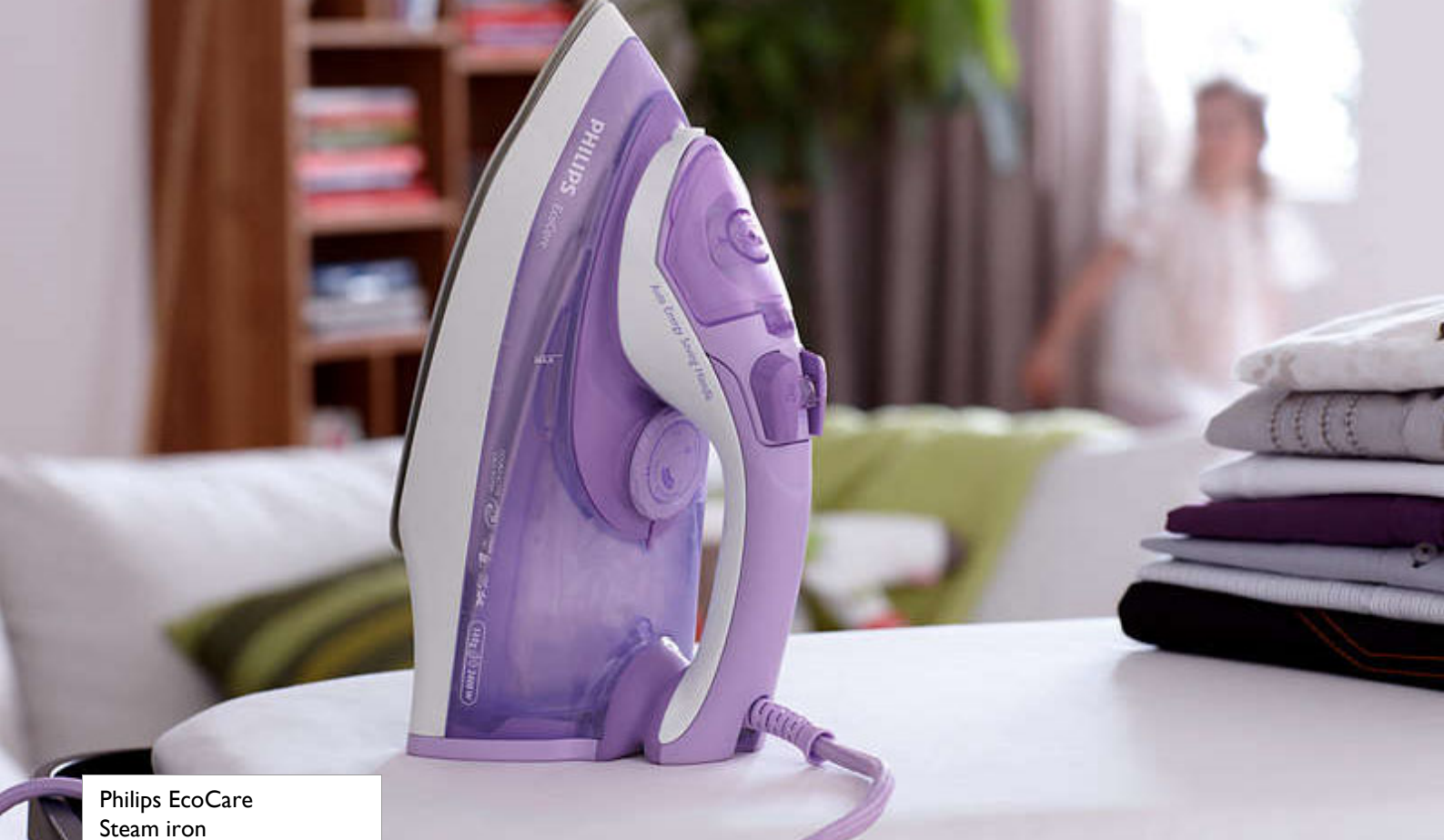
Philips EcoCare Steam iron