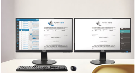
EasyRead mode for a paper-like reading experience