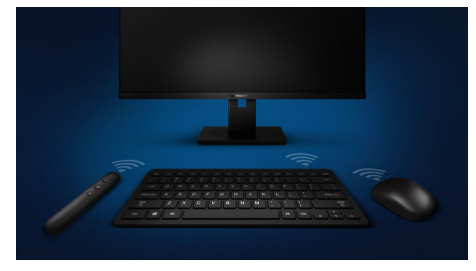
Easy to connect and tangle free, the wireless design makes life more simple.