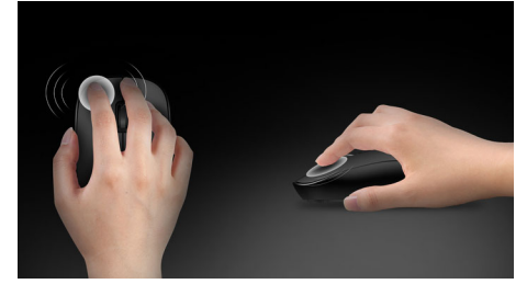
Buttons last millions of clicks for durability