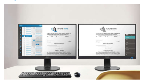
EasyRead mode for a paper-like reading experience