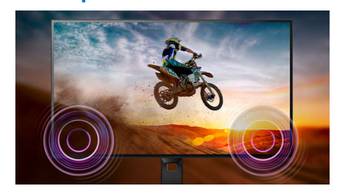
A pair of stereo speakers built into a display device. It can be visible front firing, or invisible down firing, top firing, rear firing etc, depending on model and design.