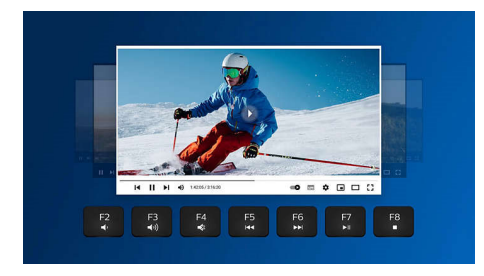
With these multi-media shortcuts, you can easily switch to music, volume, or video play by a simple click.