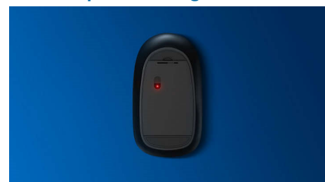
High definition optical tracking for smooth control