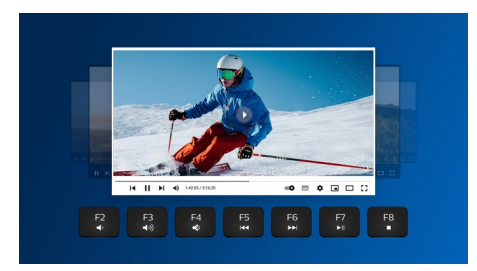
With these multi-media shortcuts, you can easily switch to music, volume, or video play by a simple click.