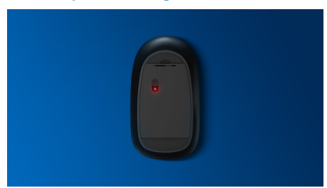
High definition optical tracking for smooth control