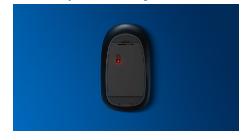
High definition optical tracking for smooth control