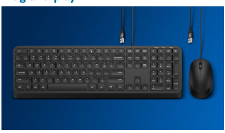
Simple plug-and-play wired USB connections