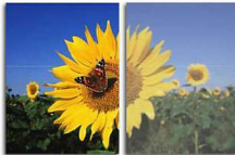
With SmartImage Without SmartImage

SmartImage is an exclusive leading edge Philips technology that analyzes the content displayed on your screen and gives you optimized display performance. This user friendly interface allows you to select various modes like Office, Image, Entertainment, Economy etc., to fit the application in use. Based on the selection, SmartImage dynamically optimizes the contrast, color saturation and sharpness of images and videos for ultimate display performance. The Economy mode option offers you major power savings. All in real time with the press of a single button!