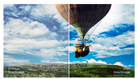
SmartImage is an exclusive leading edge Philips technology that analyses the content displayed

on your screen and optimises your display performance. This user-friendly interface allows you to select various modes, like Office, Photo, Movie, Game, Economy etc., to fit the application in use. Based on the selection, SmartImage dynamically optimises the contrast, colour saturation and sharpness of images and videos for ultimate display performance. The Economy mode option offers you major power savings. All in real time at the touch of a single button!