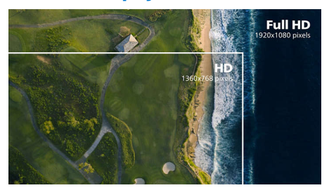
Picture quality matters. Regular displays deliver quality, but you expect more. This display features enhanced Full HD 1920 x 1080

resolution. With Full HD for crisp detail paired with high brightness, incredible contrast and realistic colours, expect a true-to-life picture.