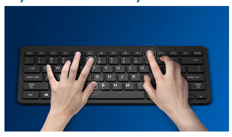
Keys last millions of keystrokes for durability