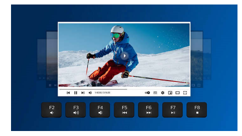
With these multi-media shortcuts, you can easily switch to music, volume or video play by a simple click.