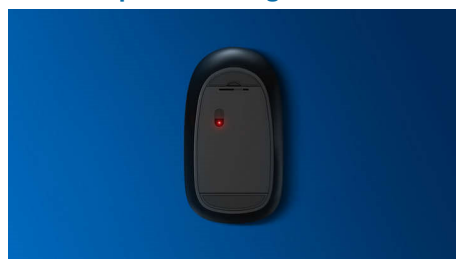
High-definition optical tracking for smooth control